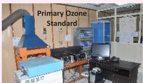
Primary Ozone Standard

Precise, traceable measurements for atmospheric pollutants; Primary reference gas mixture; Testing/calibration facility for continuous emission/ambient air monitoring systems and for PM 2.5 & PM 10 samplers.