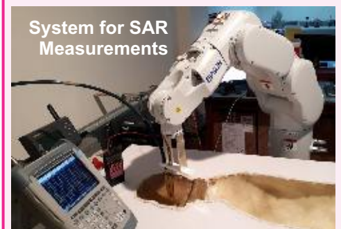
System for SAR Measurements

Testing and calibration facility for Impedance attenuation, Power, E-Field, SAR, Radiation power density for microwave with increasing utilities concern for health safety.