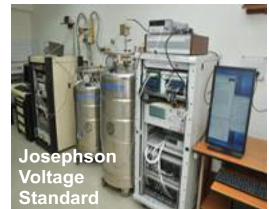
Josephson Voltage Standard

Apex level calibration for traceability in Physico-Mechanical, Electrical & Electronics Parameters: Mass, Length, Optics, Temperature, Force, Pressure, Acoustics, Fluid Flow, AC Voltage & Current, Power, DC Voltage, LF-HF-Impedance, Inductance, Capacitance, for improving Research & Technology and strengthening the Industries.