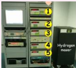
Bank of Cesium Atomic Clocks

CSIR-NPL generates, maintains & disseminates IST, traceable to UTC. R&D on Atomic Clocks. Time synchronization and Calibration for strategic sectors. Aiming for nation wide synchronization \leq 1s .