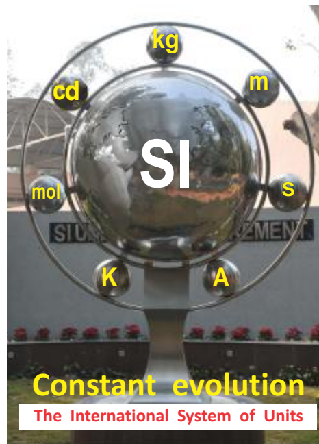
Constant evolution The International System of Units